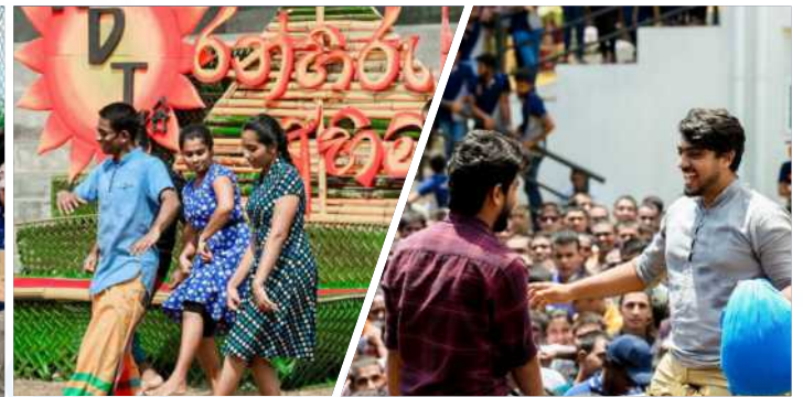
“Itipandam Hendewa” and “Ulpatha”