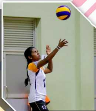
AK Sandeepani Electrical 2018/19 Volleyball Women