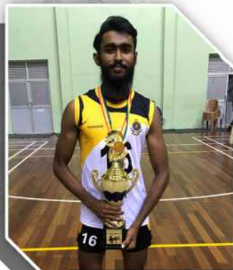
HPPI Sandanayaka Textile 2017/18 Volleyball Men

The following students of the ITUM were appointed as the Vice-captains of the university volleyball (men and women), karate, elle and javelin throw teams for the year 2019/20.